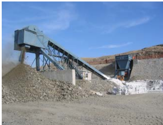
1000 tonnes per day pilot crusher built in 2004 at 217 Project

Mario Rossi, a qualified person as defined by National Instrument 43-101, supervised the preparation of the information in this release.